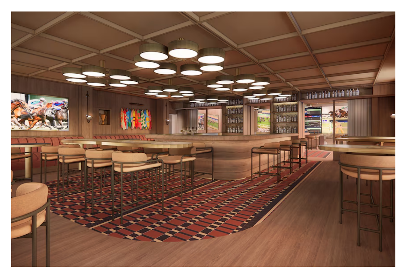
The new hotel will include a sports bar.

It was initially called the Prince of Wales, but was renamed as the Victory Hotel in 1921 after the Allies won World War I.