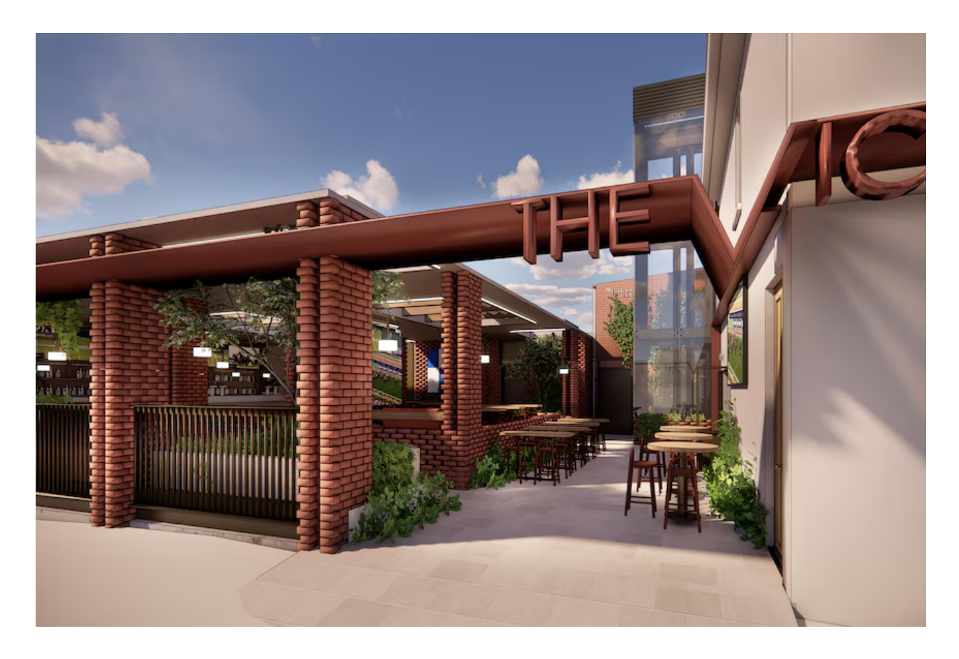
The new design includes outdoor seating.