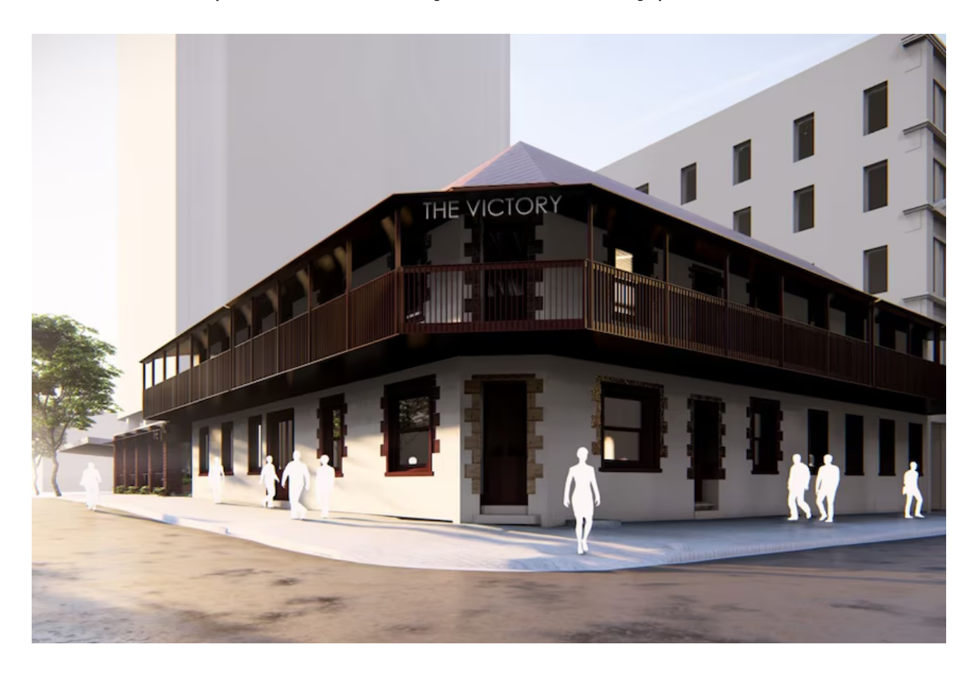
The new design removes the iconic V sign.

The owners, Precision Group, have submitted plans for a multi-million dollar redevelopment for the 169-year-old inner city pub on Edward Street.