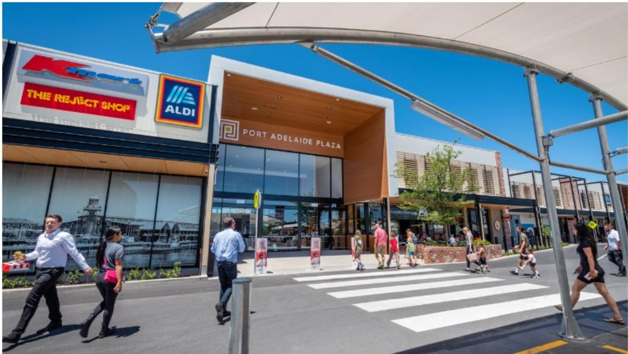
The Port Adelaide Plaza shopping centre.