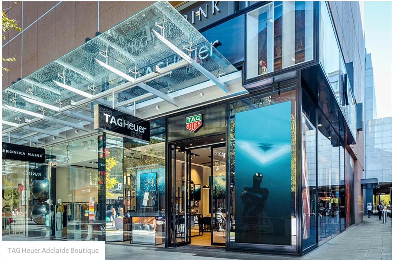
TAG Heuer Adelaide Boutique

with the benefit of the opportunities that this presents, and the continued strength of luxury retail across the globe, we are reimagining Adelaide Central Plaza through a major new investment, to further elevate the retail experience for customers.