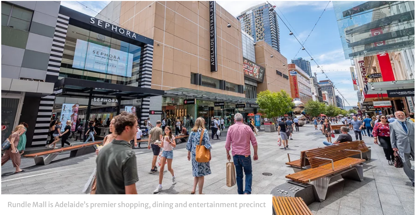
Rundle Mall is Adelaide's premier shopping, dining and entertainment precinct

“A dedicated luxury precinct in Rundle Mall will enhance Adelaide’s reputation nationally and internationally, attract major investment, and continue the significant commercial development in the Adelaide CBD that has been going on in the last several years, which has included the recent completion of new luxury hotels, major office towers and a major casino redevelopment and expansion on the city’s riverbank, all within a short walking distance from Rundle Mall.